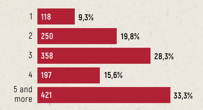
Exhibit 5: Number of active participations in chat group during the day

This data confirms that the students' language skills are in intensive development. To communicate in several chat groups at the same time, means to be involved in using several language characters in parallel and different communication patterns. Each application and intern communication requires its own language rules, signs, codes, and meanings. Although written communication in these groups includes language that is non-standard.