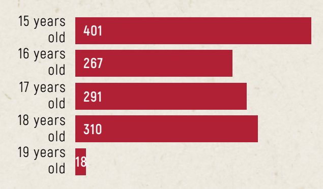
Exhibit 2: Participants disaggregated by age

Due to the objective circumstances mentioned above, complete gender equality could not be reached (because it depended on the motivation of students for answering the questions and the motivation of the teachers to pursue the principle of gender equality in the selection of the group. (see Exhibit 3: Participants per age). It should be taken into account that high school classes have a larger number of girls in the classes.